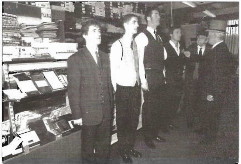
KIPPS AND SHOP BOYS