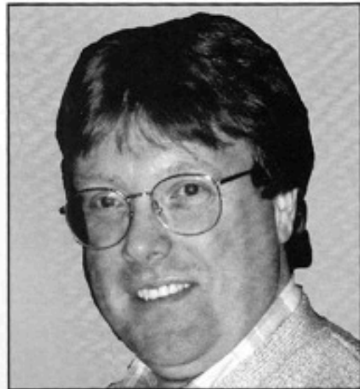
WILD BILL HICKOCK TONY BLACKSHAW